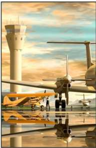
CENTENNIAL AIRPORT 1968-2008